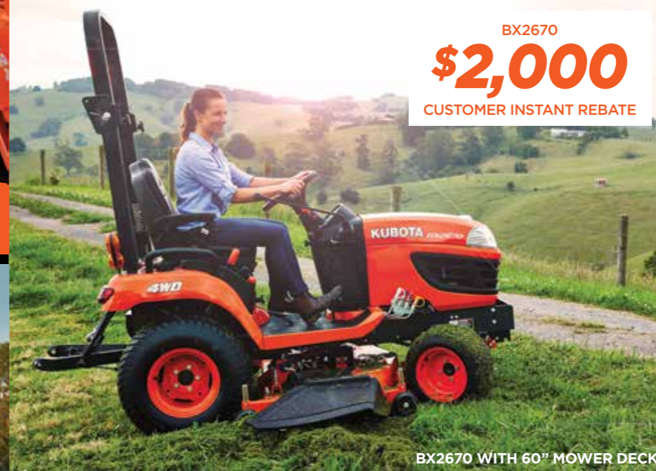
BX2670 WITH 60" MOWER DECK